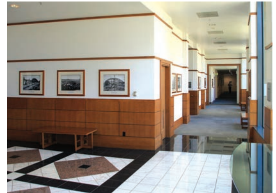
Community History Exhibits, Alameda and Contra Costa County, US District Court, 4th floor Lobby, Oakland