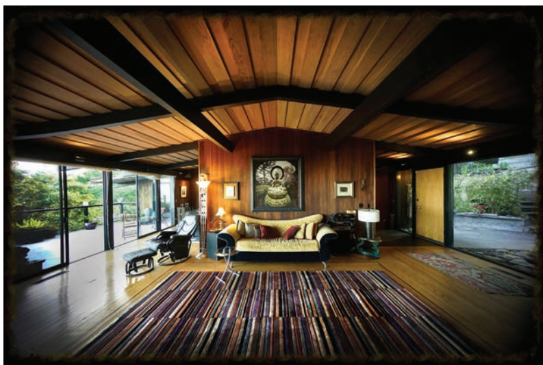
The living room at SkyHouse

Feldenkrais® practitioner, had her own practice and a large team back home in Adelaide. "That led to forming an early-stage company, TORSON, that produced 4D anatomically correct human virtualization for medical education and entertainment-media applications," she said.